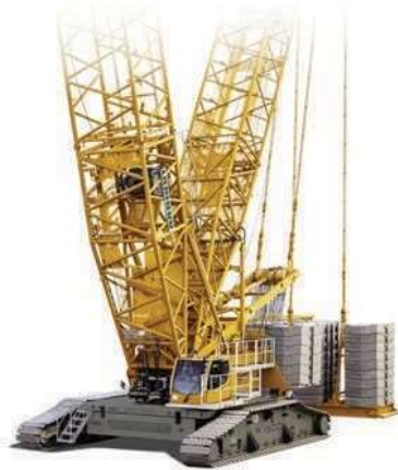
LIEBHERR LR 1500