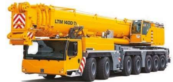
LIEBHERR LTM 1400