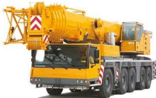
LIEBHERR LTM 1220