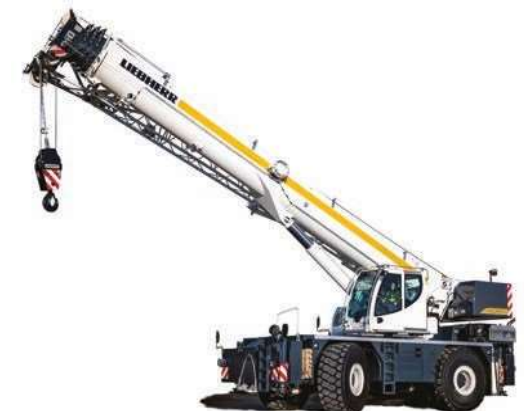
LIEBHERR LRT 1100