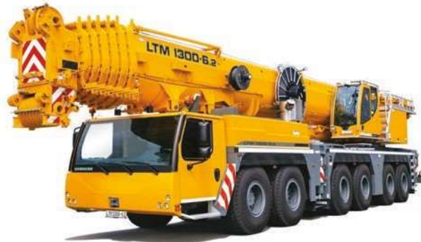
LIEBHERR LTM 1300