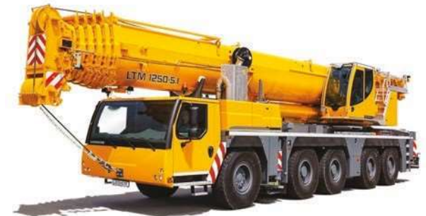
LIEBHERR LTM 1250