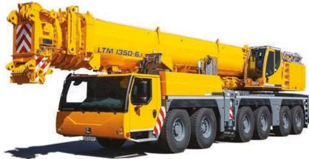
LIEBHERR LTM 1350