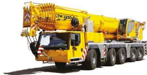
LIEBHERR LTM 1230