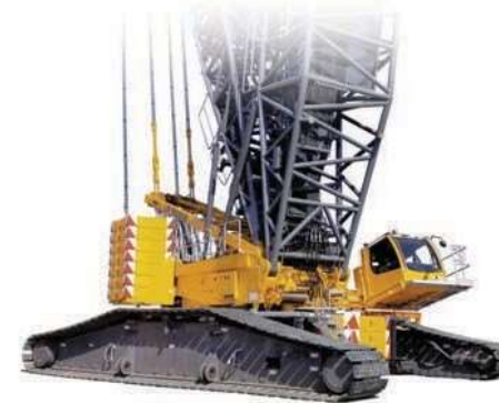
LIEBHERR LR 1600