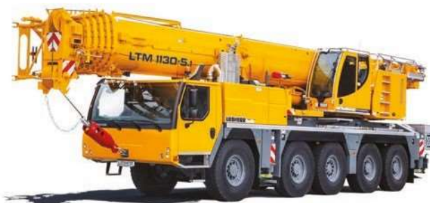
LIEBHERR LTM 1130