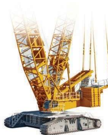
LIEBHERR LR 1750