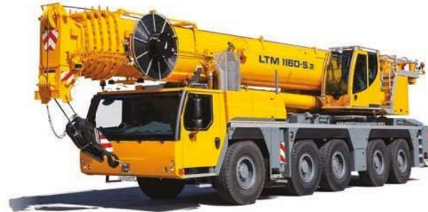
LIEBHERR LTM 1160