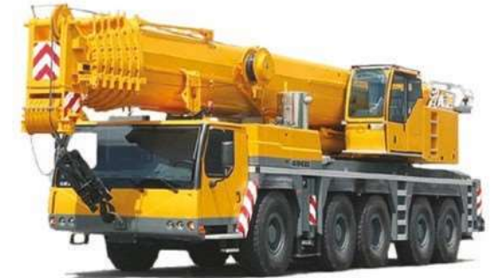
LIEBHERR LTM 1200