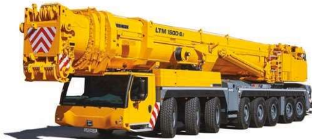
LIEBHERR LTM 1500