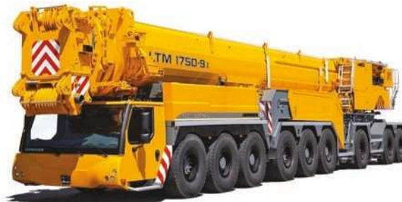
LIEBHERR LTM 1750